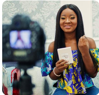
Creators & freelancers