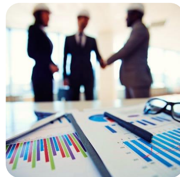
Government institutions & agencies