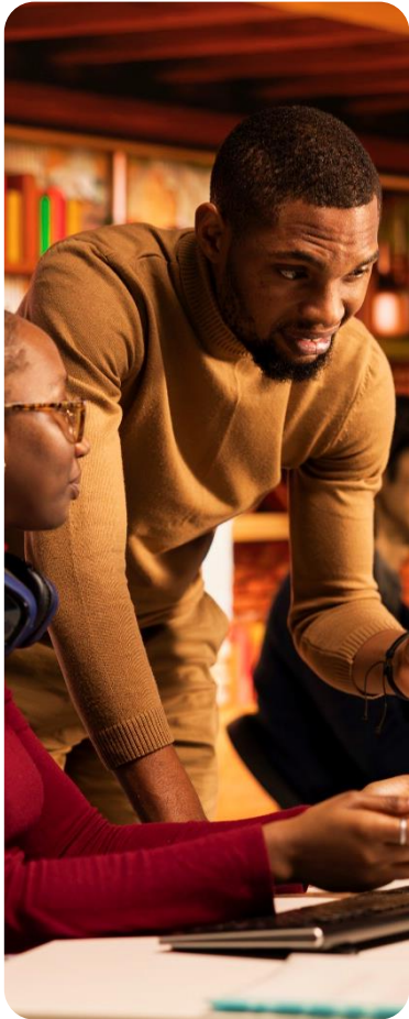
Early-stage ideators & startups